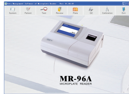
Data Management Software